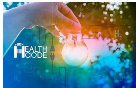
Figure 2:Health-Code visual identity

The launch of the website of the project: